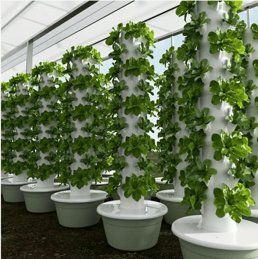
Fresh food. Less space. Smarter systems.