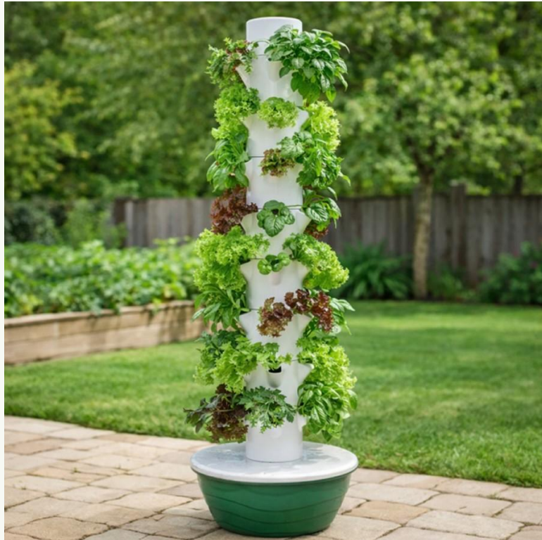
Fresh, efficient and practical vertical growing.